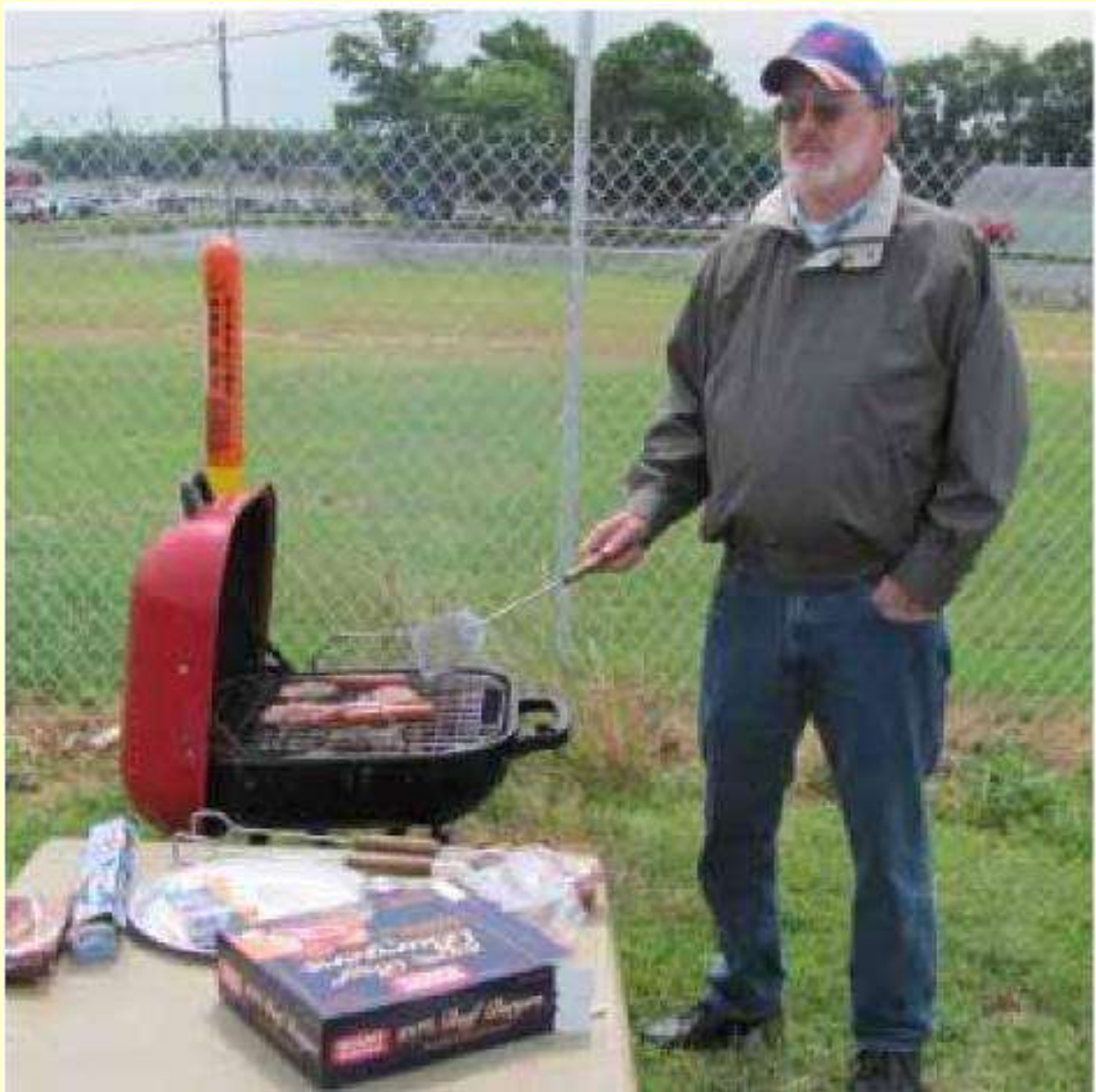
N3SBF seen at Breezeshooters Hamfest

Please join us for the next North Hills Amateur Radio Club breakfast! We meet every second Saturday 9 AM at Reflections Café, located at 644 Center Avenue, off Route 19, in West View. This location is directly across the street from the former West View Amusement Park. All amateurs are welcome – you do not need to be a member of NHARC!