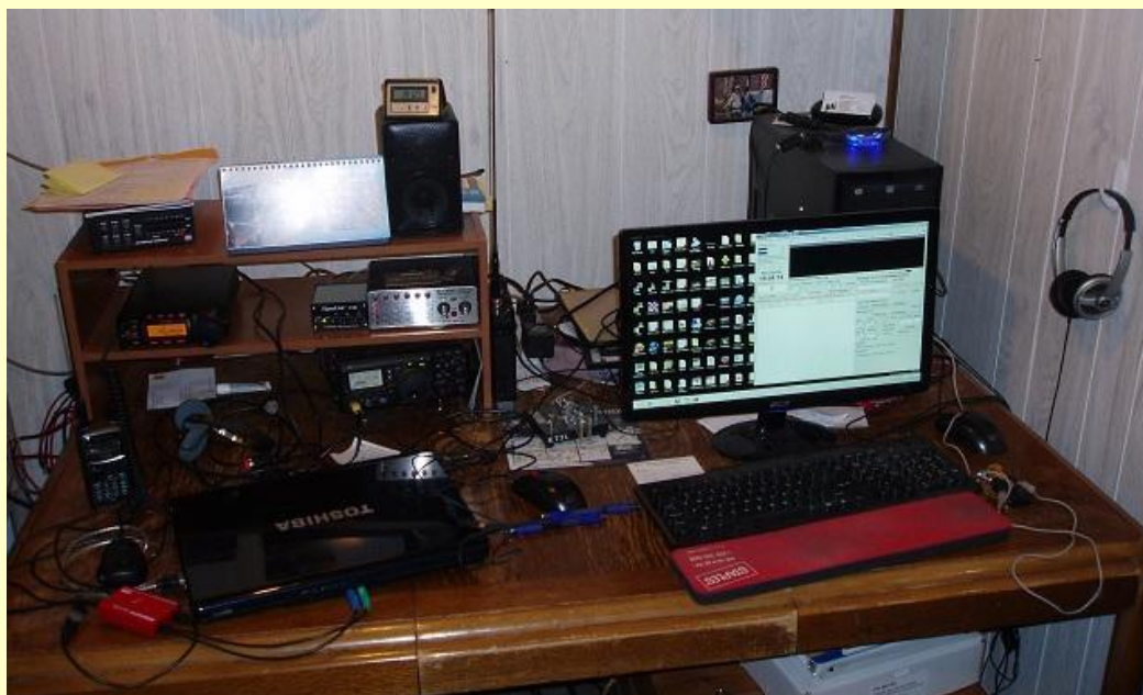
2012. Did you say something about "wireless"?

Ye Olde Editor's Note: I am always accepting "Shack of the Month" pictures. Please send me your shack and antenna pictures! Thanks!