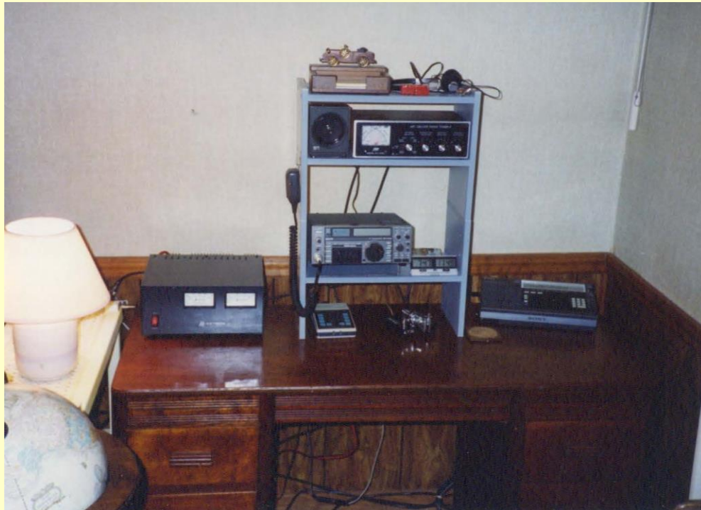
1993. Back to a minimal shack, but I did have a Tandy 102 portable computer hidden away for contest logging.